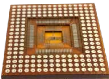
Vertical IC integrated

Nano Dimension (Nasdaq: NNDM) is a leading additive electronics provider of 3D printed electronics that is disrupting, reshaping, and defining the future of how functional and connected products are made. With its unique additive manufacturing technologies, Nano Dimension targets the growing demand for electronic devices that require sophisticated features. Demand for circuitry, including PCBs, sensors and antennas - which are the heart of electronic devices - cover a diverse range of industries, including consumer electronics, medical devices, defense, aerospace, automotive, IoT and telecom. These sectors can all benefit greatly from Nano Dimension's products and services for short-run manufacturing and rapid prototyping. For more information, please visit www.nano-di.com